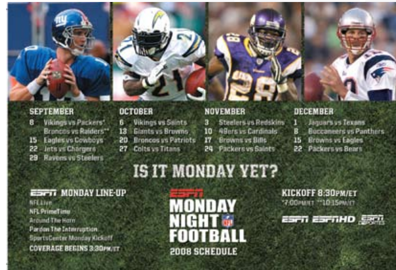
MAGNET OF SCHEDULED GAMES FOR MONDAY NIGHT